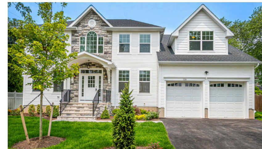
THE HILLWOOD MODEL