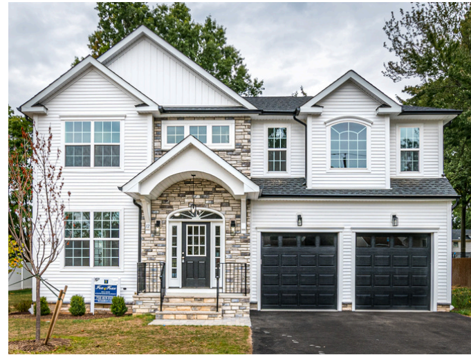
THE HECTOR MODEL