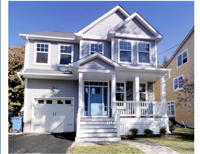
THE MYRTLE MODEL