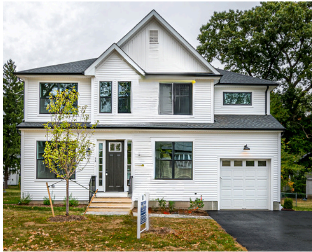
THE RUNYON MODEL