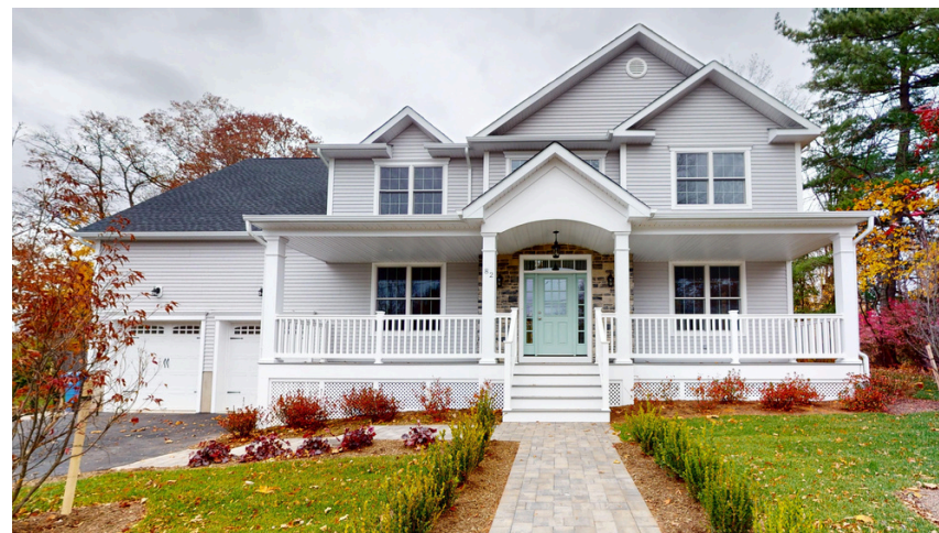
THE ROSE MODEL